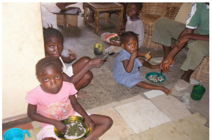
Children in Bernard's mother's house