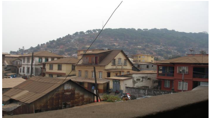
Bernard's childhood street in Freetown