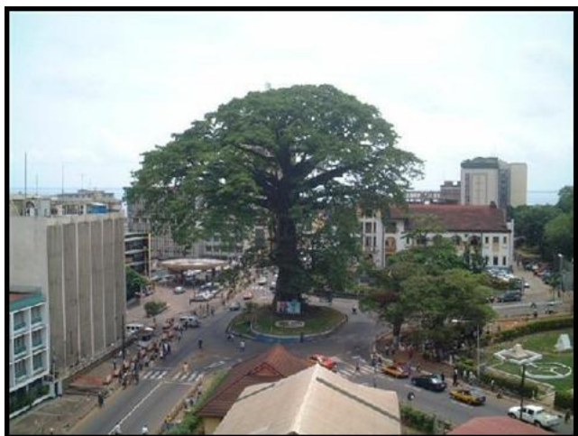
Big tree in heart of Freetown