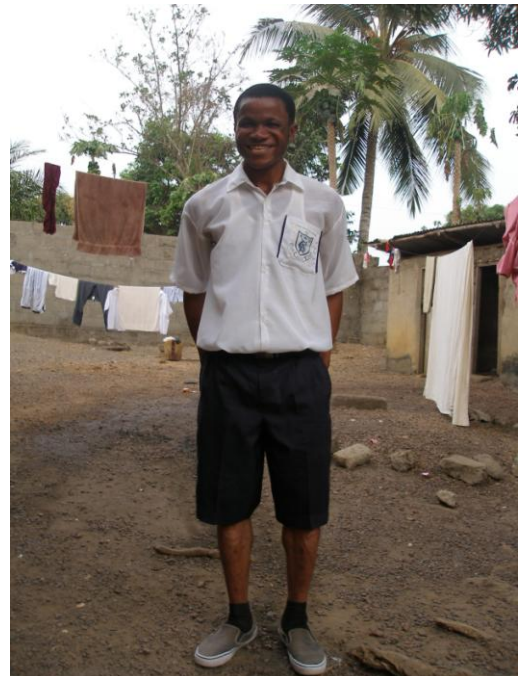
Boy who used to live with Bernard's parents