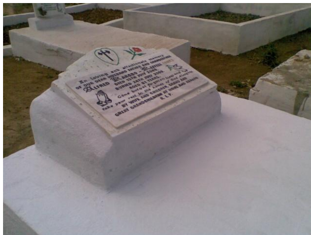
Bernard's father's grave (died 2009)