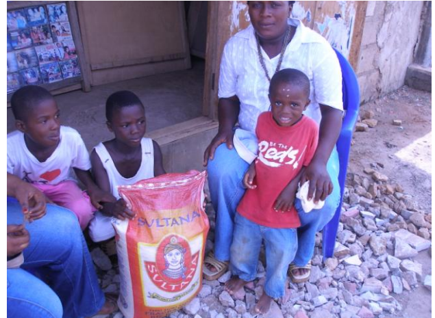
Friends in Ghana