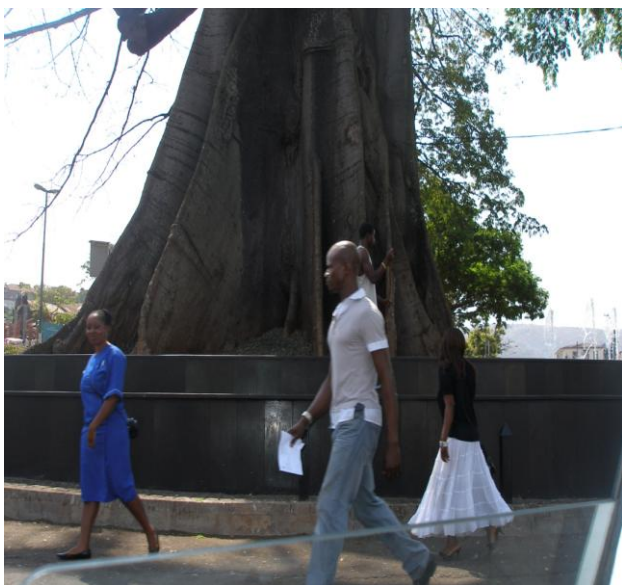
Symbolic tree in Freetown