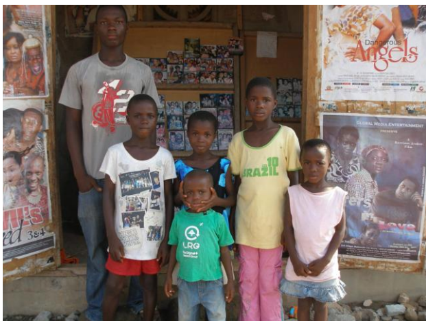
Family in Ghana