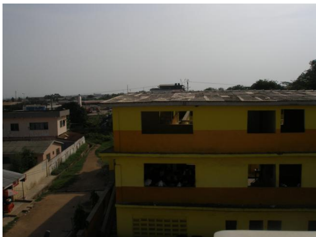
Town in Ghana