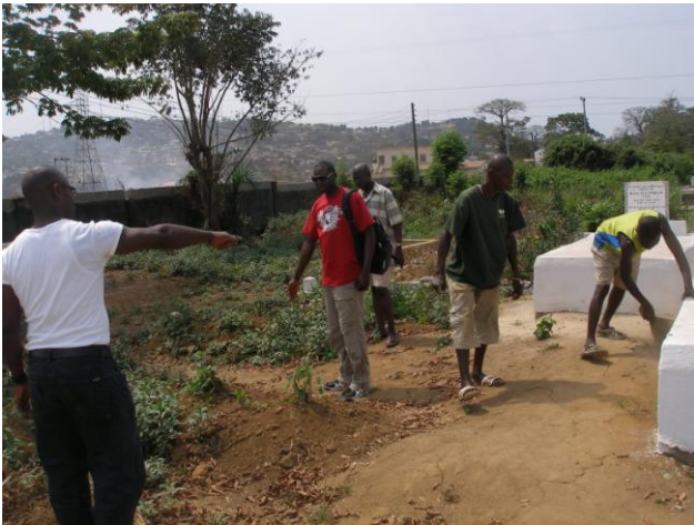
In the cemetery